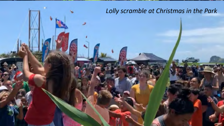
Lolly scramble at Christmas in the Park