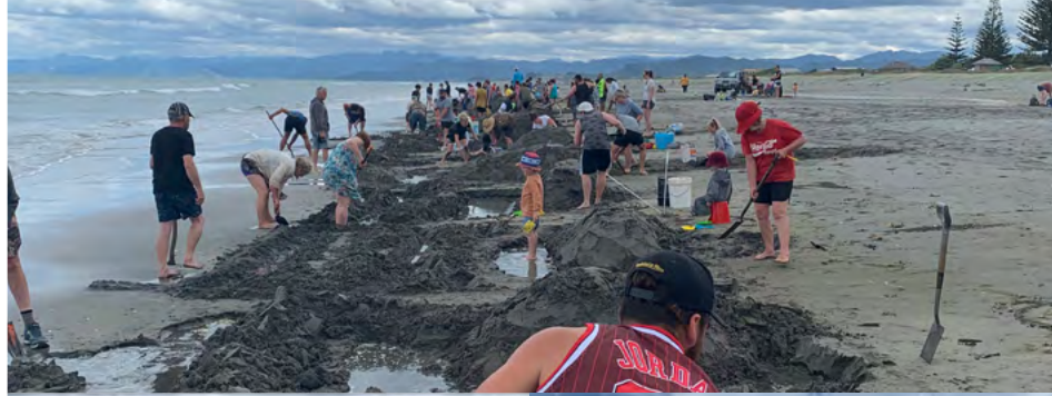
Race the tide – Teams building their sand structures to fight off the incoming tide