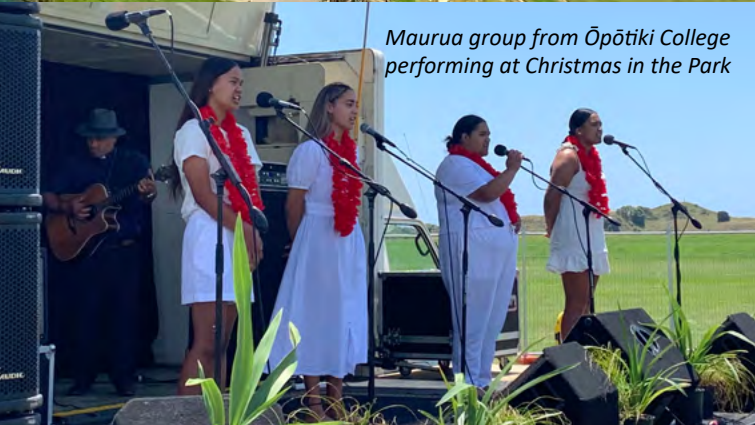
Maurua group from Ōpōtiki College performing at Christmas in the Park