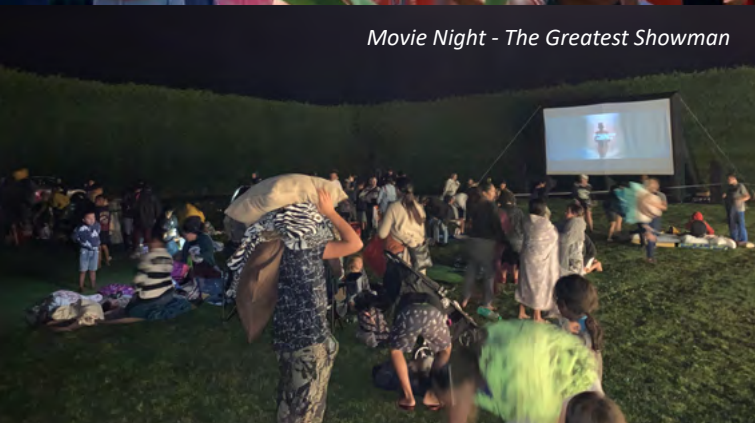
Movie Night - The Greatest Showman