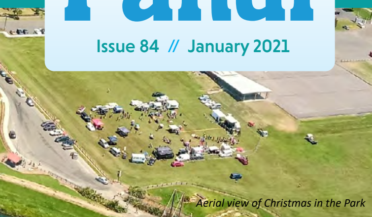
Aerial view of Christmas in the Park