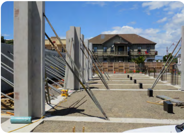
Photo below: Te Tāhuhu o Te Rangi is starting to take shape on the corner of King and Church Streets.

While this large-scale construction is underway, we are also working with our arts planning group to make sure we have amazing local artwork inside and outside the building. Council successfully applied for Creative NZ funding ($149,700) through Ngā Toi ā Rohe - Arts in the Regions for a series of Toi Māori so Te Tāhuhu o Te Rangi reflects our community and our history inside and out.